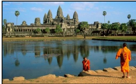
ANGKOR WAT - CAMBODIA

VIETNAM - Ho Chi Minh City (formerly Saigon, War Remnants Museum with exhibits from the Vietnam War); Cu Chi Tunnels (from the War); Mekong Delta (boat ride, floating market, villages); Hanoi (Ho Chi Minh Mausoleum); 2 day/1 night cruise on Halong Bay (beautiful bay with thousands of limestone islands); LAOS - Luang Prabang (old royal capital, sacred Buddhist city; UNESCO World Heritage Site); Kouang Si Waterfall; Pak Ou Caves; Mekong River boat trip CAMBODIA - Angkor (great ancient city with magnificent temples like Angkor Wat); Traditional Cambodian dance performance in Siem Reap.