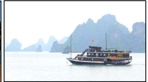
HALONG BAY - VIETNAM