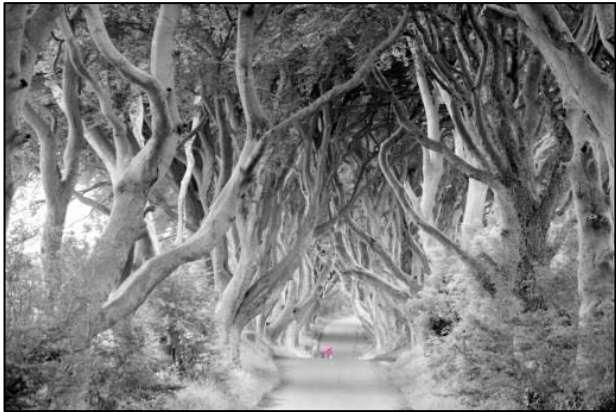
THE DARK HEDGES