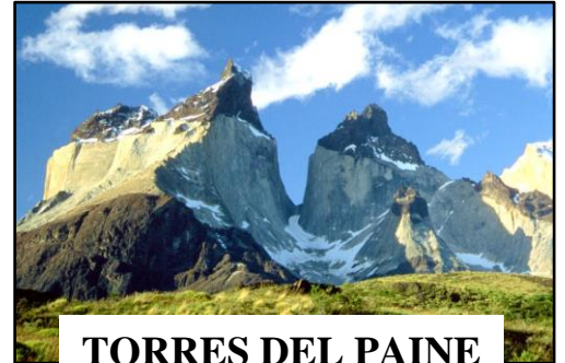
TORRES DEL PAINE