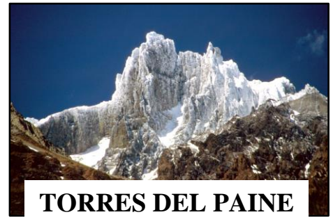
TORRES DEL PAINE

Depart Buenos Aires to return to the USA. Many flights (Copa, LATAM) depart in the morning. If departing on a later flight, spend the day exploring Buenos Aires. Arrive in the USA the same day.