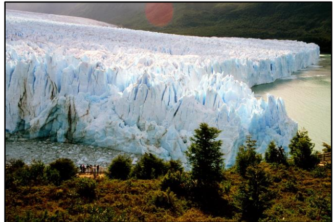
PERITO MORENO GLACIER