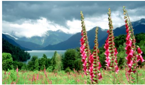
LAKE DISTRICT, CHILE